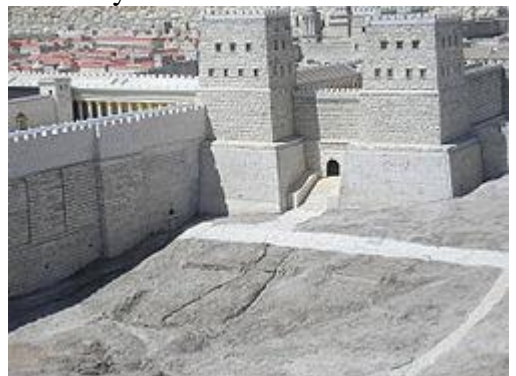
Model of Antonia Fortress, where the Second Wall Began Eruvin 101

The Mishna brings a dispute between Rabbi Meir on one hand, and the Sages and Rabbi Yose on the other, regarding the permissibility of unlocking a door when one is in a different reshut than the door. Rabbi Meir forbids it, and the Sages permit it based on their claim that in people were lenient on the matter in the שוק של פטמים in Second Temple-era Jerusalem.